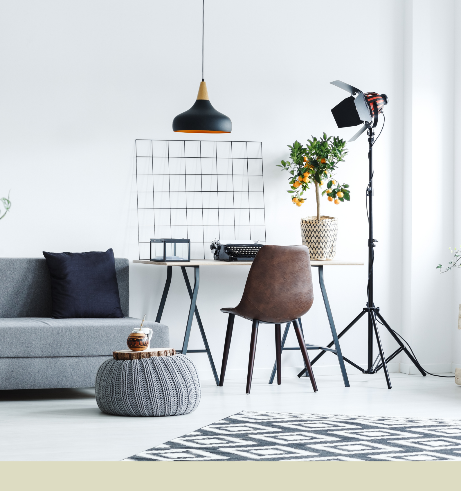
Dallas-area Photography Studios